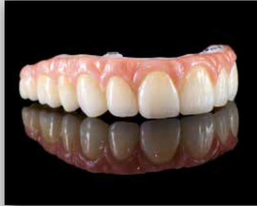
Prettau Bridge $5500

Full contour Prettau zirconia with porcelain layered in the aesthetic zone. Gingival and non functional areas are solid zirconia.