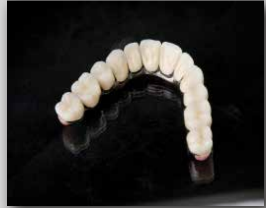
Zurick Bridge Ti $5500

Titanium substructure with individual crown preps that are opaqued and individual e.max crowns. Gingival architecture is composite.