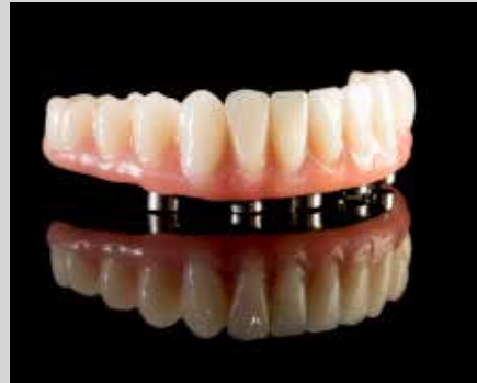
Montreal Bar $3000

Hybrid option that includes: Titanium bar wrapped with acrylic and finished with nano hybrid Phonares II denture teeth.