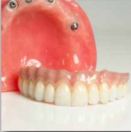
Zurick Bridge Zr $6250

Zirconium substructure with individual crown preps and individual e.max crowns. Gingival can be pressed e.max ceramic or composite.