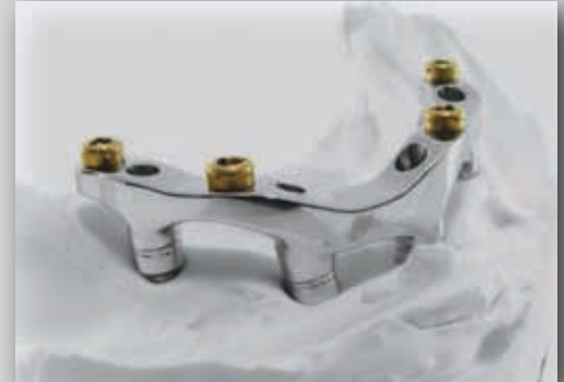
Montreal Bar-Overdenture $2500

Titanium milled bar with tapped and screwed locators, custom designed to support a Precision over-denture. *Recommendation is that a metal framework be designed inside the over-denture for maximum strength and support. Additional $150 for metal framework